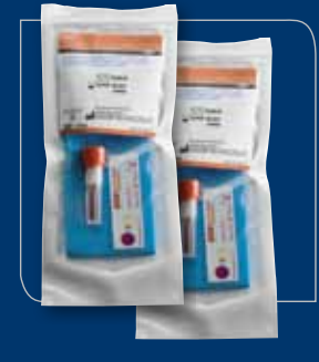
The Verify® V24 Self Contained Biological Indicator Test Pack