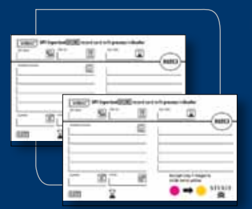
Verify® Vaporized Record Cards with Process Indictor