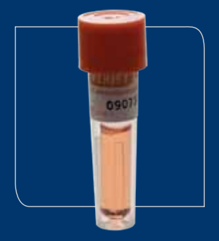
Verify® V24 Self Contained Biological Indicators