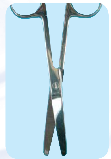
Various water qualities with Prolystica ultra concentrates added